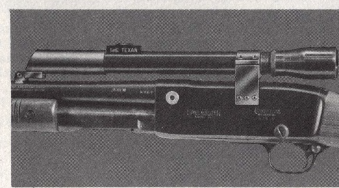
Remington 141 Texan Scope, Stith "Streamlined" Mount.